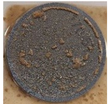
Filtercake residue after GeoWASH application and flowback