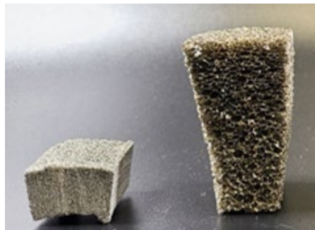
GeoFORM foam expanded by GeoWASH

Delayed filtercake breakthrough allows GeoFORM to fully expand