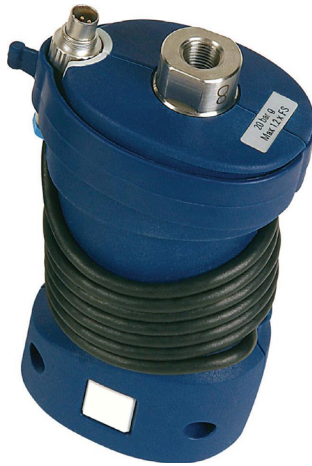
External IDOS universal pressure module

*Provides absolute pressure option in addition to gauge pressure. In absolute mode adds barometric pressure to gauge pressure range. For absolute mode ranges below 1 bar please consult your sales representative.