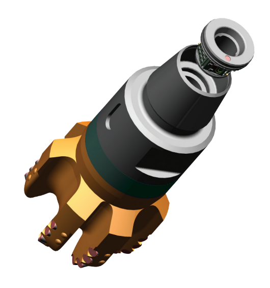
Multi-sense HD module provides an understanding of bit rotation and vibrations with a statistical summary every 3 seconds.

Contact your Baker Hughes representative to learn how Sabio Drilling Insights can improve performance on your next well.