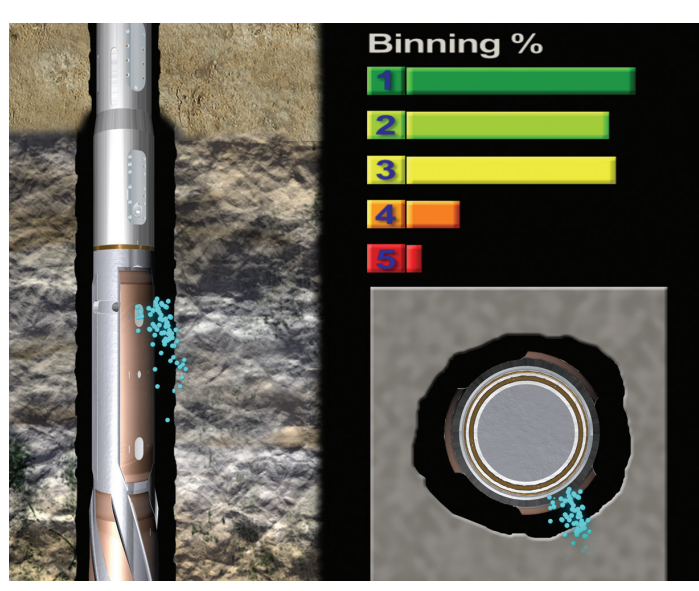
Proprietary standoff binning software integrates a direct measurement of standoff with each density sample to ensure measurements with minimal standoff are given preference ensuring more accurate and precise formation density measurement.

drilling programs frequently featuring multiple target zones (with each one adding to the well's potential uncertainty), the need for precise, real-time reservoir navigation data has never been more critical. When combined with potential fluid content and lithology identification, the LithoTrak service's accurate formation porosity permits operators to update their drilling plans in real-time. With the LithoTrak service, acquisition methods and data density can be optimized as needed to successfully complete various well sections with minimal uncertainty.