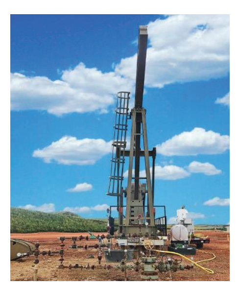
Figure 2: Single pump providing dual combination treatment

The improvement in ESP performance enabled the operator to sustain production and reduce operating expenditures (OPEX) resulting from less intervention work and production deferment.