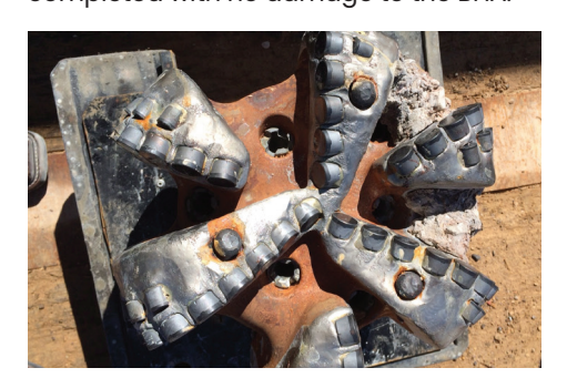
The TerrAdapt bit showed a very good dull condition after the run because its adaptive elements mitigated stick-slip and absorbed impacts to protect the cutters.

The TerrAdapt bit completed the 3,355-ft (1023-m) section in one run, increasing ROP by 27% compared to ROP on offset wells drilled with standard PDC bits. ROP averaged 168 ft/hr and the surface torque generated by the TerrAdapt bit was 45% lower on average and 90% more consistent. This translated to more efficient drilling, with up to a 45% improvement in mechanical specific energy recorded. These results indicated dramatically reduced stick-slip and torsional oscillations, and the section was completed with no damage to the BHA.